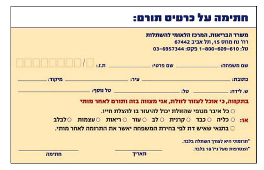
Fig. 1. Donor card in Israel. Translated into English the card reads: With the hope that I may be of help to another, I hereby order and donate after my death: () Any organ of my body that another may find of use to save his/her life. Or: () Kidney () Liver () Cornea () Heart () Skin () Lungs () Bones () Pancreas [] As long as a clergyman chosen by my family will approve the donation after my death.

J.B. Kessler, A.E. Roth / Journal of Public Economics xxx (2013) xxx-xxx